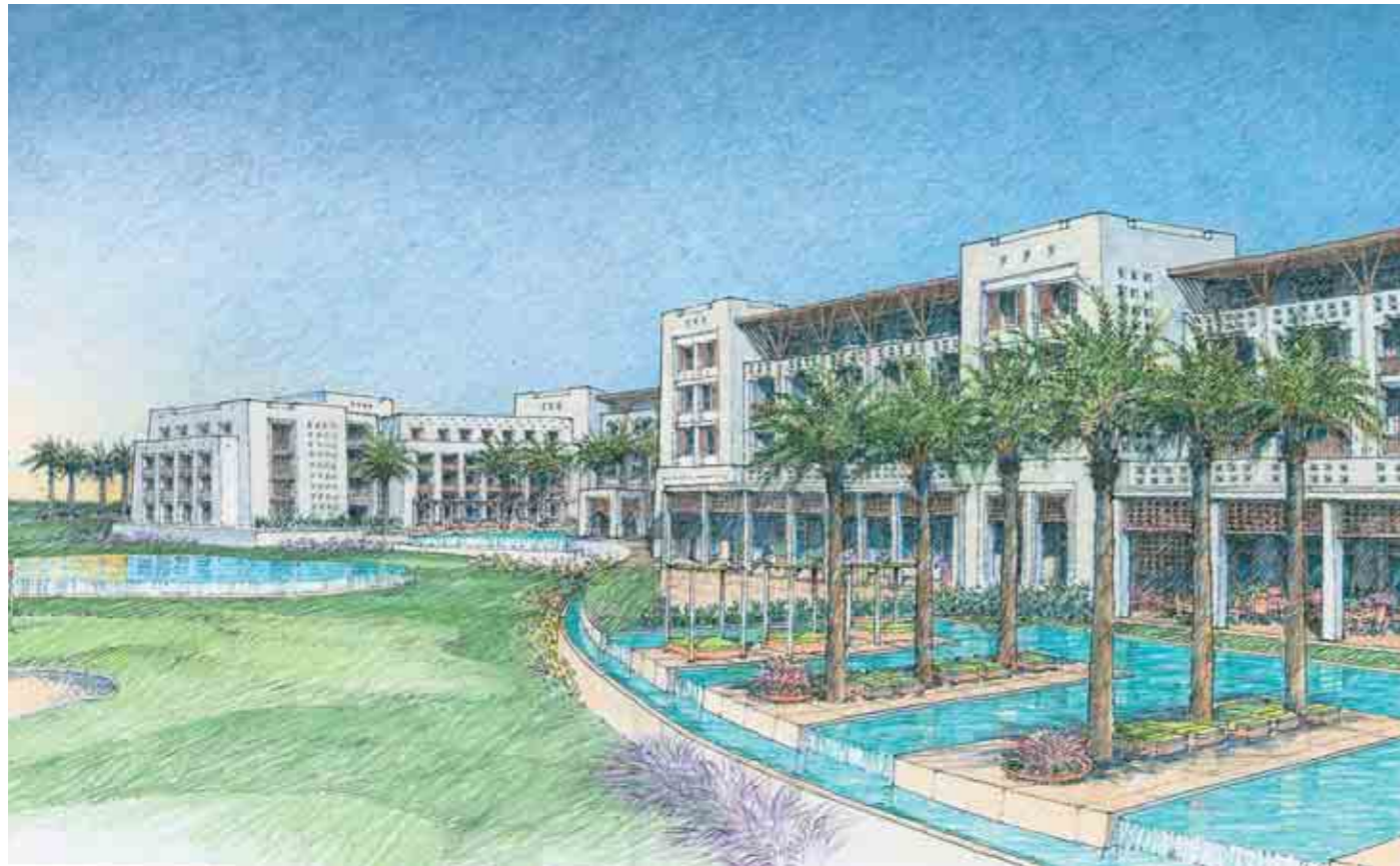
Preliminary rendering of Ritz-Carlton