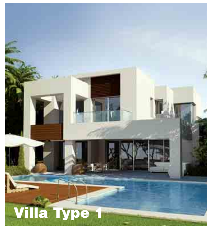
Villa Type 1

The designs created by renowned architect Shehab Mazhar, are set to transform the architectural master plan of homes in the North Coast area. Mazhar created unique bold designs that enhance the "Think Green" concept of creating ecological and sustainable designs which successfully blend seamlessly with the serene Mediterranean Sea, and complement the beautiful views of the surrounding environment.