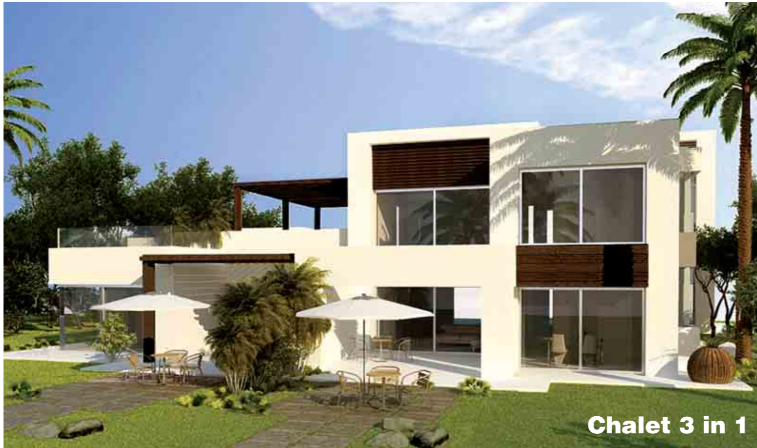
Chalet 3 in 1